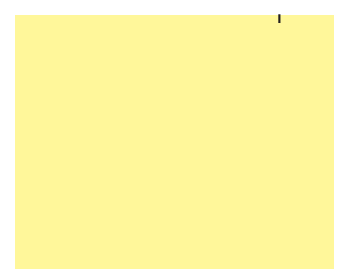
figure 2. Gafchromic<sup>™</sup> HD-V2 film in landscape view showing slit in top right corner

To help in distinguishing between the sides, sheets of Gafchromic<sup>™</sup> HD-V2 films are marked with a small slit near one corner. When film is viewed in a landscape orientation with the slit in the top right corner as shown in Figure 2, the unlaminated active layer is on the side facing the viewer.